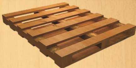
* Two-way Entry Pallets