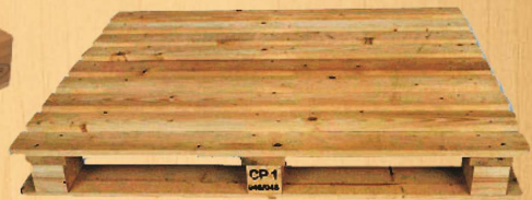
* CP Pallets