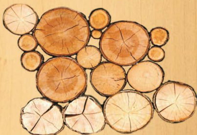
* Pine Wood Timbers