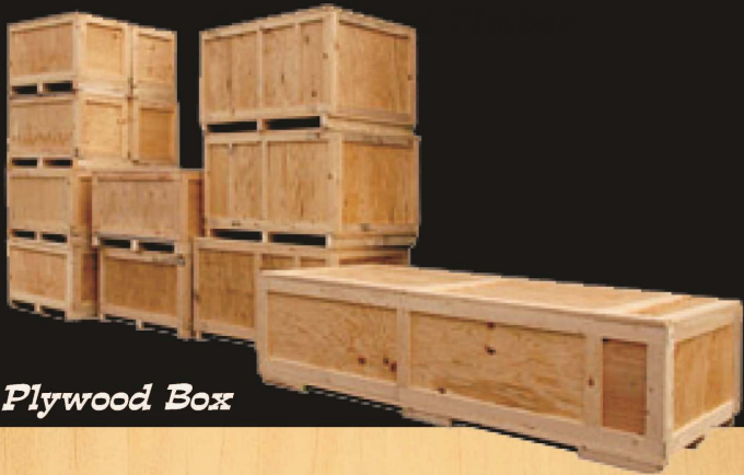
* Plywood Box