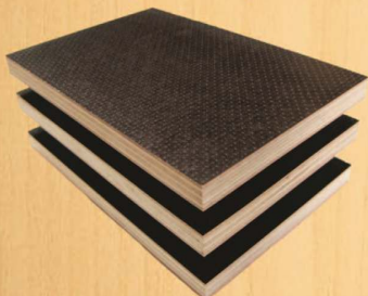
* Film Faced Plywood