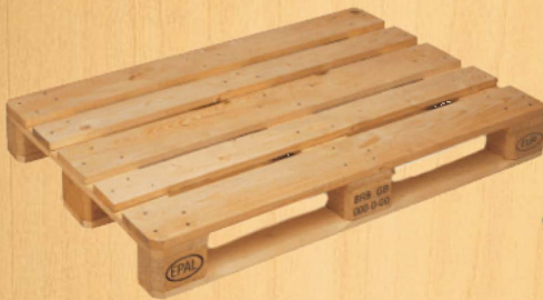
* Euro Pallets