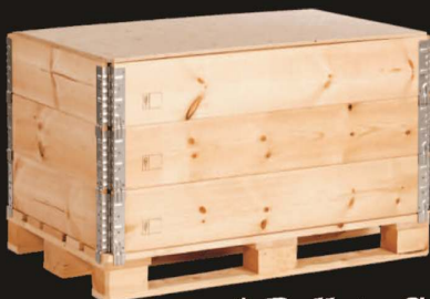
* Pallets Collers