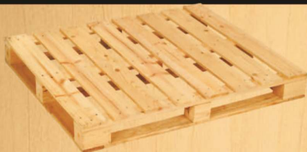
* Four-way Entry Pallets

Backed by profound knowledge of market, we are engaged in manufacturing, supplying and trading a significant range of Wooden Pallets, Boxes and Crates. Products comprised by this range are developed by making use of supreme quality basic material, sourced from the distinguished vendors of the markets. Furthermore, we develop all our products in complete adherence with the clients preferences so as to live up to the their expectations. Our products are highly appreciated by our clients for their longer service life, resistance against termite, high compressive strength and superior finish. These products are available with us in different sizes and designs suited to the divergent demands of the clients.